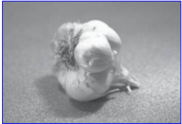
Garlic ( Allium sativum ).

In another study on patients with both hypertension and diabetes, patients were given 3 g of L-arginine every hour for 10 hours over 2 days and this produced a drop in systolic blood pressure of about 12 mmHg and a drop in diastolic blood pressure of about 6 mmHg. 18 These effects were reversed within hours of L-arginine cessation. As it is impractical to take L-arginine orally every hour, a t.i.d. dosing schedule of 2–5 g may be attempted, or a time-release product utilized. An additional benefit of L-arginine therapy is that its ability to vasodilate can also help support better erectile functioning that often becomes compromised with long term circulatory disease.